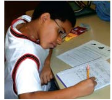
Sigma Nu Fraternity

Please include your ad or message on the following page. This will ensure that you receive recognition for your generous contribution.